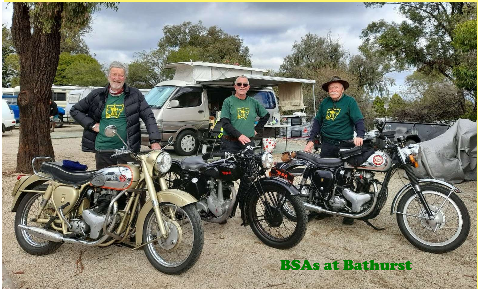
BSAs at Bathurst